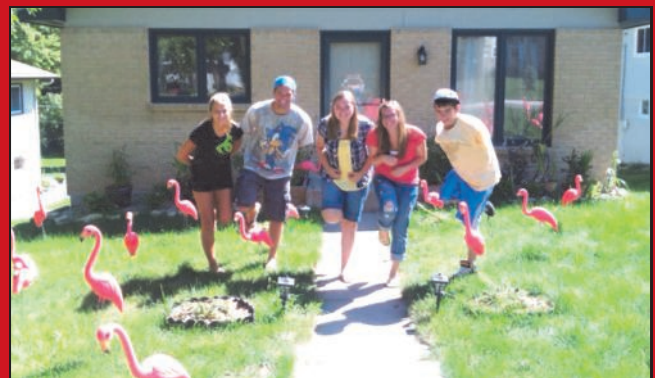
The flamingo flocking fundraiser this past summer was one way the teens earned money for their trip to World Youth Day 2011.